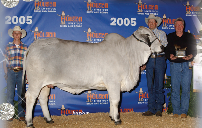
Ms. Tiara Diamond D'Oro 273 2005 ABBA Show Cow of the Year