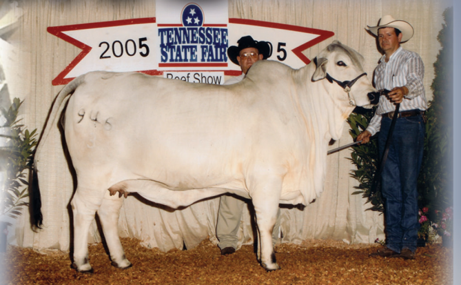
Tiara Lexus D'Oro 946/3 2006 ABBA Show Cow of the Year

We invite you to be a part of the 135 dynasty!