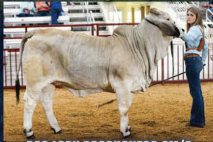
BCC LADY POCAHONTAS 211/9

Look for Bogue Chitto Cattle Consignments at Upcoming Sales!