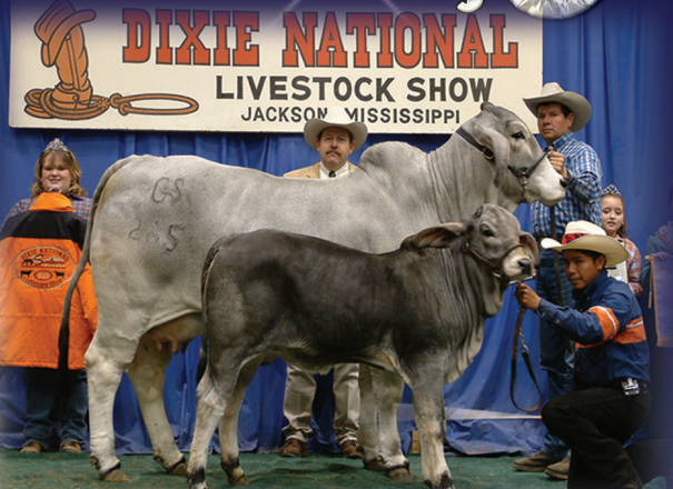
Ms. GS Empress 265 2003 ABBA Show Cow of the Year