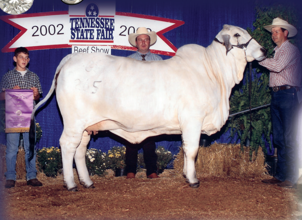
Ms. GS Empress 265 2002 ABBA Show Cow of the Year